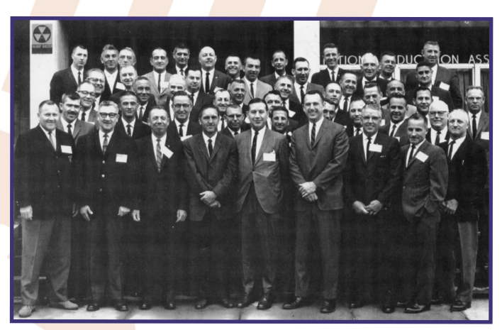
1965 NHSACA Organizing Committee

Founded in 1965, the NHSACA has a rich history of supporting high school athletic coaches and directors. For nearly six decades, we have been committed to enhancing the professional development and recognition of coaches across the nation. Our members include some of the most dedicated and influential figures in high school athletics, contributing to the growth and success of countless student-athletes.